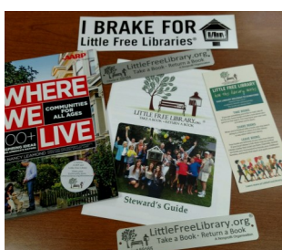
The Give Back Crew will be Stewards for the new Little Free Libraries