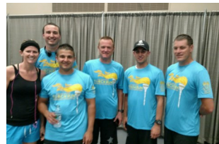
Some of the very dedicated runners at the Torch Run on 6/19/17